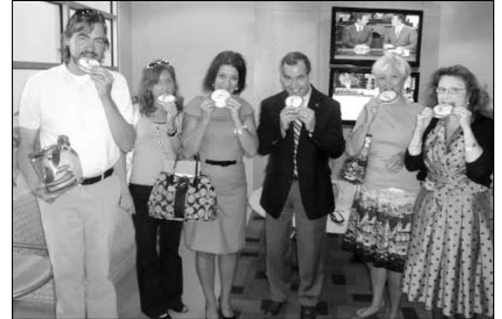
The Busken Bakery marketing team, CABVI staff and a CABVI volunteer enjoy the first Braille cookies!

Busken Bakery has locations in Beechmont, Springdale, Western Hills, 7 th & Walnut (Downtown Cincinnati), Hyde Park, Eastgate, Kenwood, Mason, Milford in Ohio and in Highland Heights, Ky.