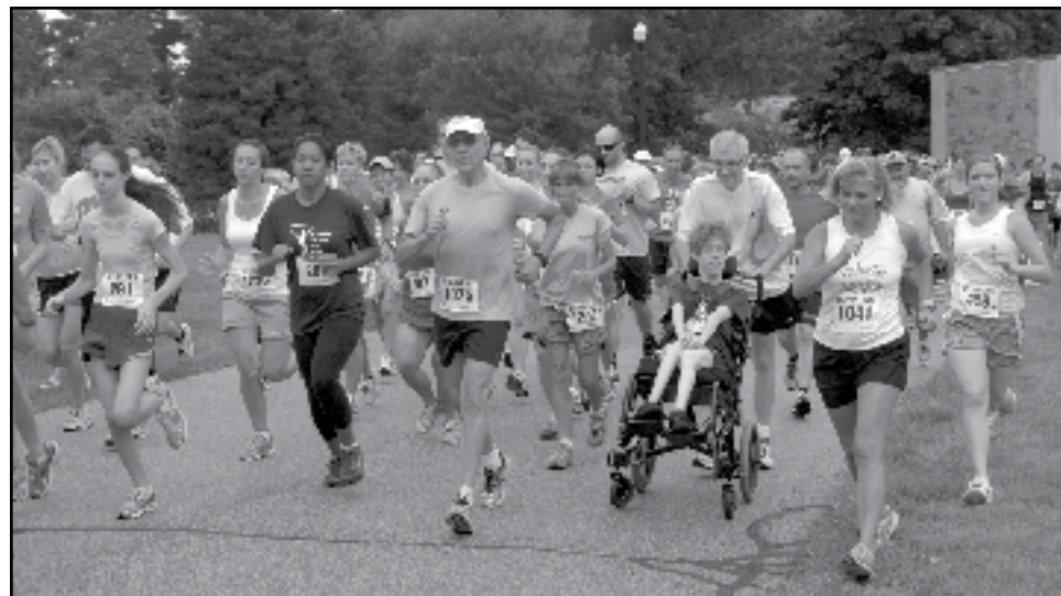
Runners begin the 5K course!

Money raised by the race will be used to help fund CABVI programs and services provided to people in an 11-county region.