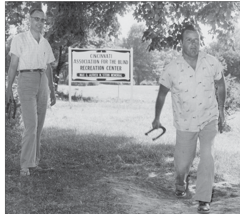
In 1958 the farm school closed and the facility operated as a recreation center until the property was sold in 1971.