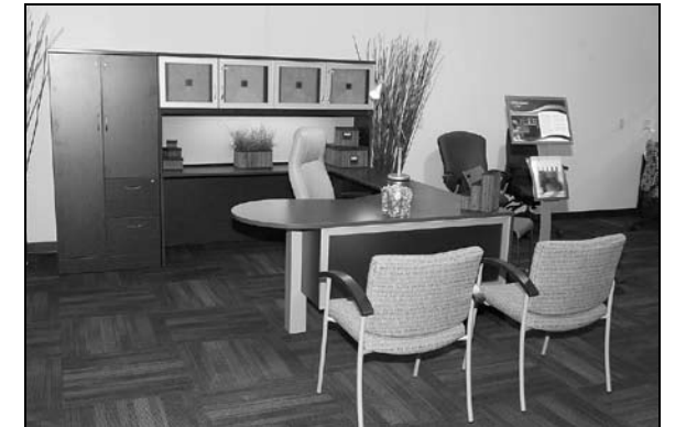
One of OFFICE RUNWAY's new furniture showrooms.