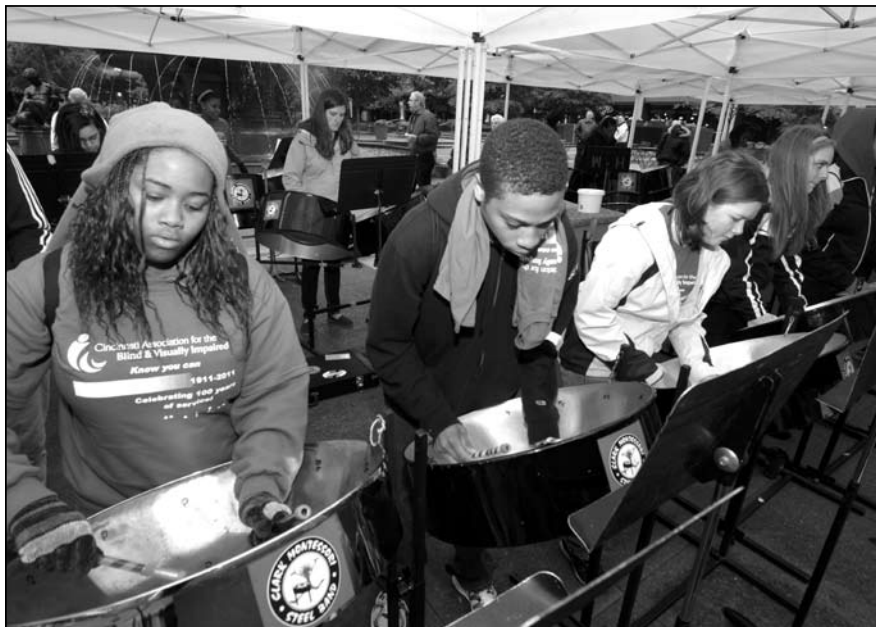
The Clark Montessori Steel Band in action!