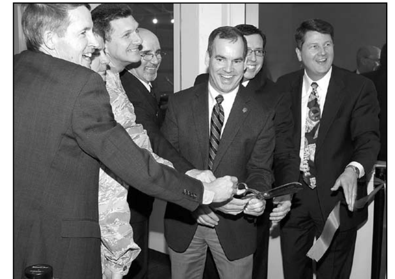
CABVI staff and Wright-Patterson AFB officials cut the ribbon.

Federal purchasing of SKILCRAFT® and other products and services under the AbilityOne Program (formerly the Javits-Wagner-O'Day Program) from AbilityOne associated agencies like CABVI employs more than 40,000 Americans who are blind or severely disabled across the nation. In 2010 OFFICE RUNWAY sold more than $1 million in AbilityOne products, with each sale promoting employment for Americans who are blind, visually impaired or who have another disability.