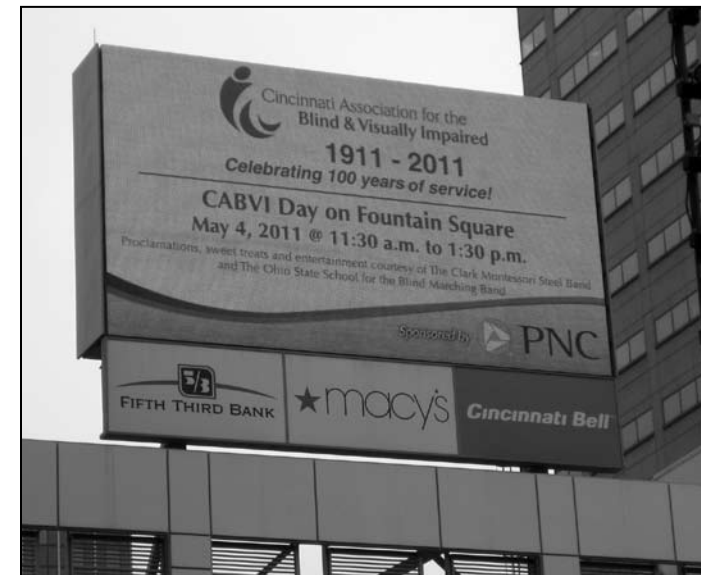
The video board atop Macy's played a slide presentation of CABVI's history.